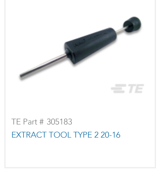
Also in the Series | AMP Type III+